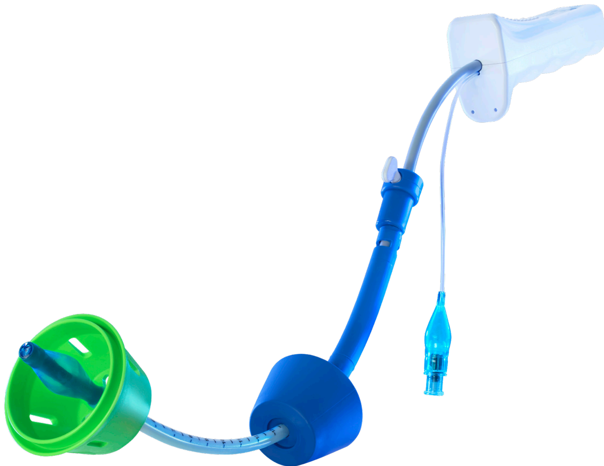
AIRSEAL® ACCESS MANAGEMENT SYSTEM

VCare® Plus helps surgeons deliver clear control of the anatomy using effective uterine manipulation while assisting with the identification of key surgical landmarks for a safe, efficient, and repeatable procedure.