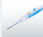
VISICLEAR® SURGICAL SMOKE EVACUATOR