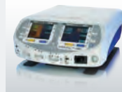
SYSTEM 5000™ ELECTROSURGICAL UNIT