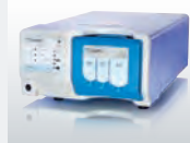
HELIXAR™ ESU WITH ARGON BEAM COAGULATION