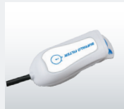
VIROSAFE ® FLUID TRAP FILTER