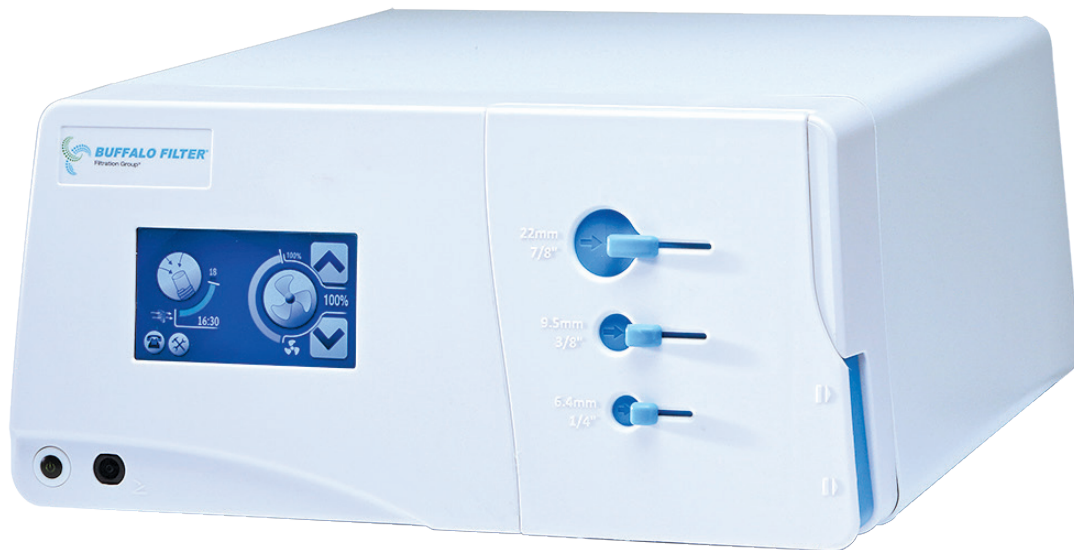
SYSTEM 5000 GENERATOR

VisiClear ® is our most advanced acute care offering for surgical smoke evacuation. Combining Safeport Technology ™ , an occlusion warning, filter life tracking, and one-touch programmable procedure modes for open tubing, electrosurgical pencil, and laparoscopic procedures, VisiClear effectively captures and filters surgical smoke, removes odors, particulates and other potentially hazardous by-products.