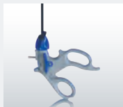
VCARE® UTERINE MANIPULATOR